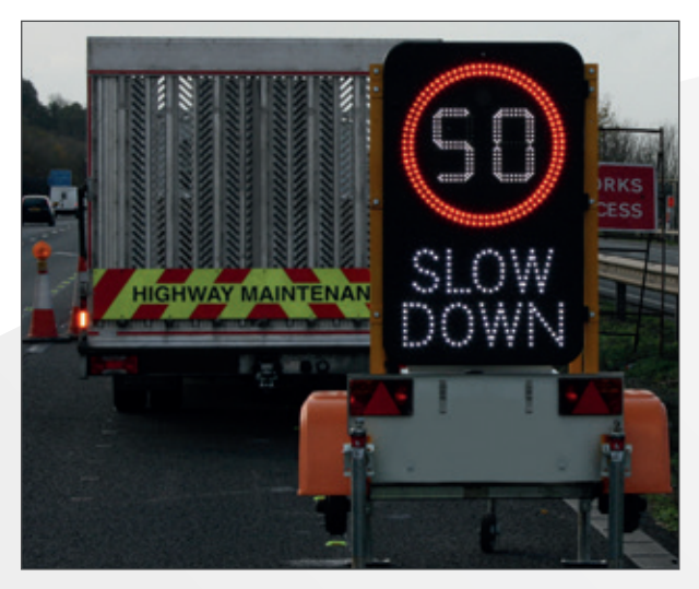
Portable Speed Radar