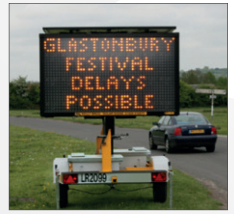
Lift & Rotate